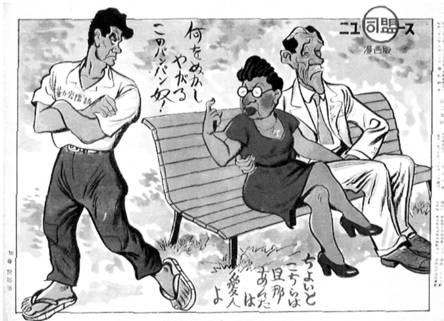
Figure 4. Text beneath the park bench: “This here [Ashida] is my danna (husband); you’re my lover!” Text between prostitute and younger man: “Just who is this whore ( pan-pan yakko ) jacking off.” Katō Etsurō. Dōmei nyūzu mangahan dai nijūkyū ban . 36cm x 26cm. PB0814: 20 August 1948.

Within a few weeks of publishing his first “Boogie Woogie” panel, Katō expanded the scope of his attacks on the politically conservative Ashida Government to include its archrival, the Japan Socialist Party (JSP). Published in the 20 August edition of the Comic News , figure 4 portrays the JSP as a plump woman whose face resembles that of former socialist prime minister Katayama Tetsu. Katō illustrates Katayama wearing a red dress (identifying Katayama in the text across “her” lap as the Socialist Party), red high heels, and red lipstick. The cross-dressed Katayama (who here represents an odd twist on the eroticized female form) is seated on a park bench beside Prime Minister Ashida Hitoshi. 79