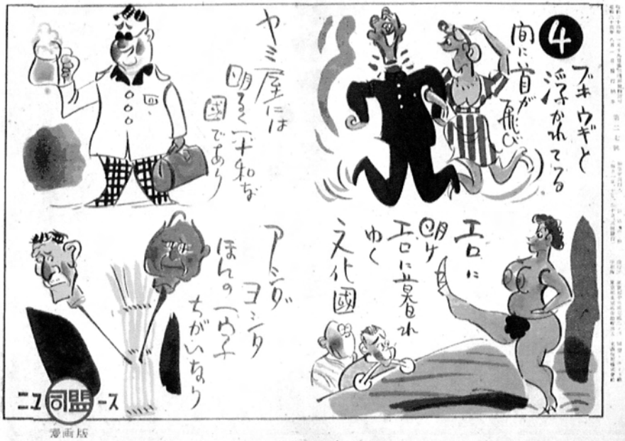
Figure 3. Bottom right: “Erotic Dawn; Erotic Dusk: [this is the] Cultural Nation ( bunka kokka ).” Bottom left: “Ashida; Yoshida — only the letters ( kanji ) are different.” Katō Etsurō. Dōmei nyūzu mangahan dai nijūgo ban . 36cm x 26cm. PB0812: 1 August 1948.

“erotic dawn; erotic dusk: [this is the] Cultural Nation.” In the first scene Katō accuses the Yoshida and Ashida Governments of being unable to jump-start the sluggish postwar economy and thus they are complicit in the mass layoffs that had accompanied the economic downturn. In the second scene, however, Katō indicts former prime minister Yoshida for promoting policies that called for building Japan into a “Cultural Nation” ( bunka kokka ), which resulted in little more than a national fascination with the “erotic grotesquerie” ( ero guro ). 77 In the third and fourth scene, Katō simultaneously condemns the Yoshida Government for the popular fascination with erotic culture and economic stagnation, decries the growing black market economy, and declares the Ashida government to be no different from that of its predecessor, Yoshida Shigeru. In effect, text and images together are the cornerstone of the artist’s assertion that the government, more concerned with promoting culture than fixing the economy, had failed at both. 78